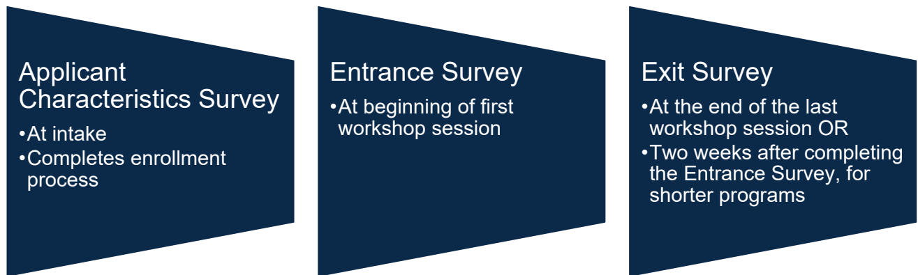
Exhibit 3. nFORM Survey Timing

All three of these surveys must be completed in nFORM, or in special scenarios, completed on paper and data entered into nFORM by a grantee staff member. Due to federal security requirements, grantees cannot reproduce the surveys in another system (e.g. SurveyMonkey) and transfer the data later.